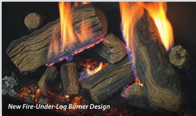
New Fire-Under-Log Burner Design