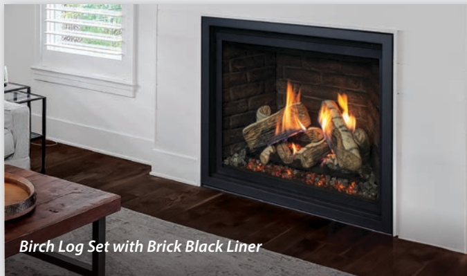
Birch Log Set with Brick Black Liner